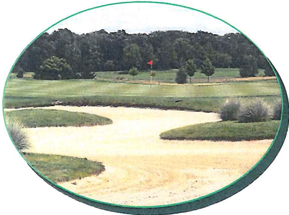
COYOTE GOLF CLUB